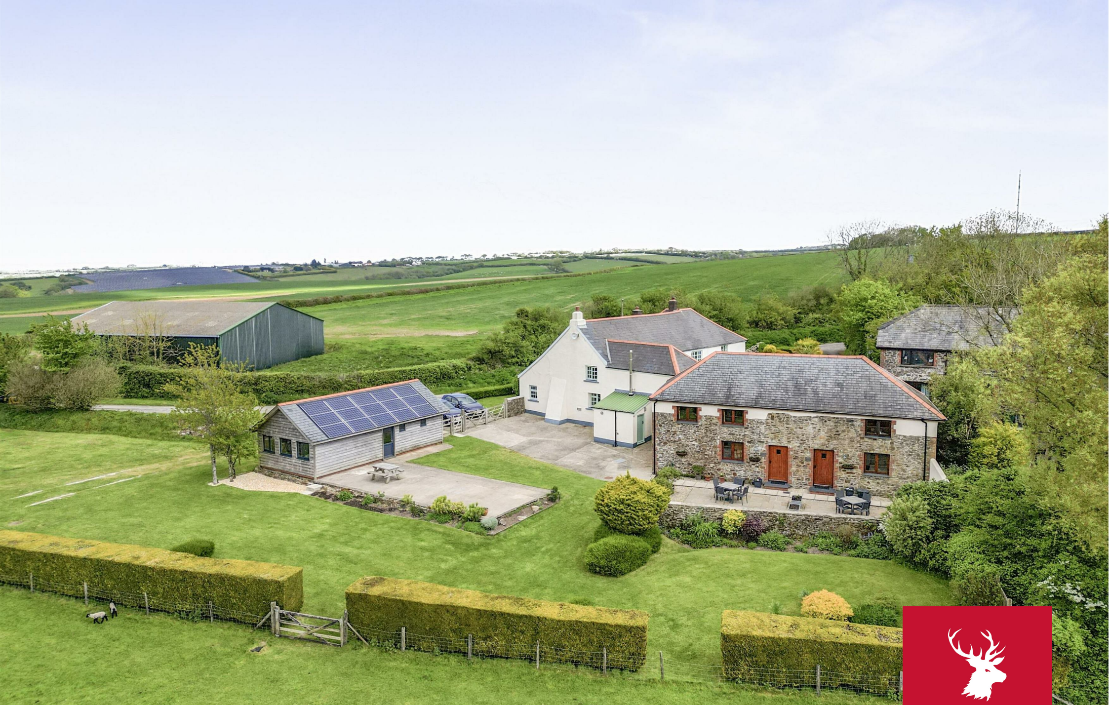
Higher Darracott Farm