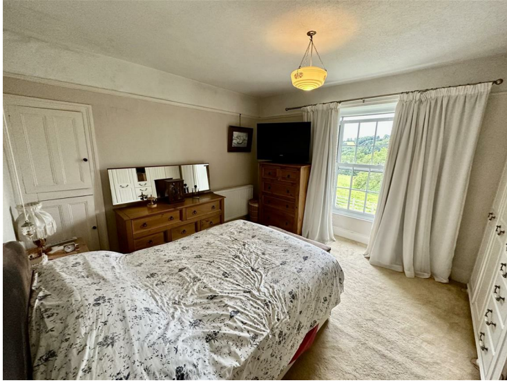
Front Double Bedroom 13'1" x 11'4" (3.99m x 3.45m)

Fitted cupboard, double wardrobes (hanging and shelved).