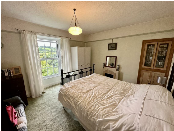
Front Double Bedroom 13' x 11'4" (3.96m x 3.45m)

Being dry and useful for storage, divided into three rooms viz.