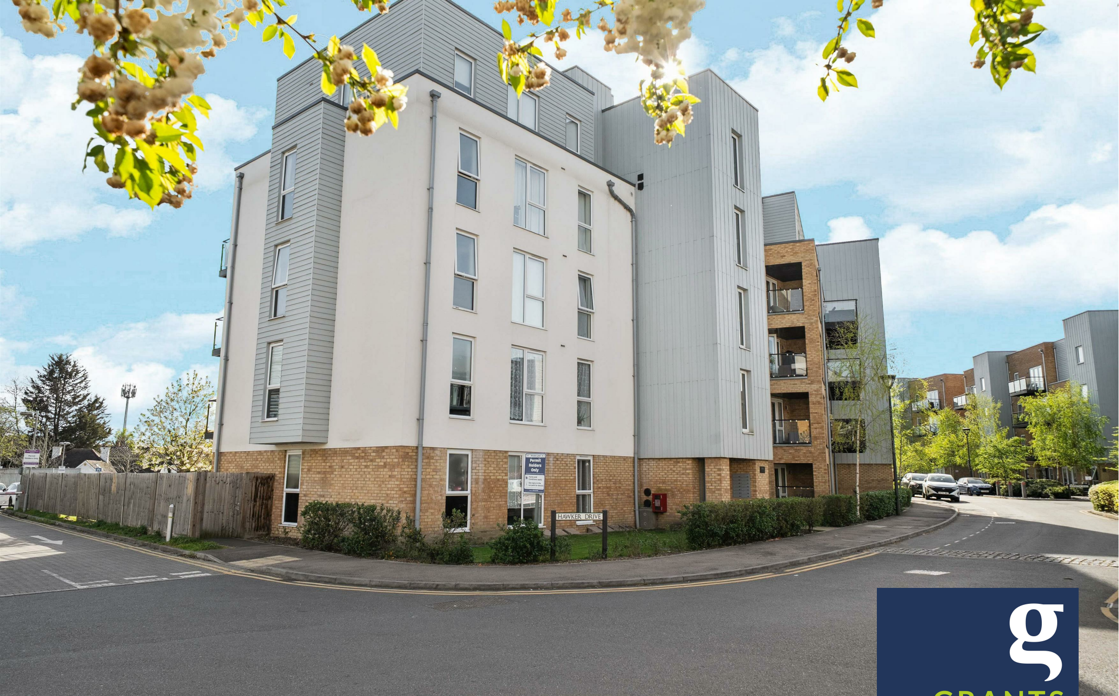
Hawker Drive, Addlestone, KT15 2FA