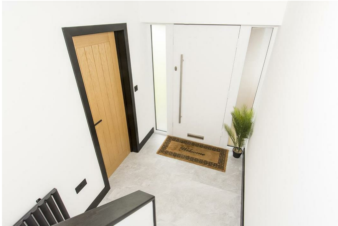
Entrance Hall 13'8" x 5'9" (4.17m x 1.75m)

Enter into the property via a new composite door into the spacious hall where you will find luxury vinyl flooring and a new grey radiator. There is an understairs storage cupboard and the stairs rising to the first floor.