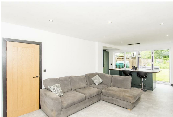
Kitchen/Living/Dining 24' x 18' x (10'4") (7.32m x 5.49m x (3.15m))

The heart of the home is this amazing living space which is perfect for entertaining friends and family or simply enjoying a relaxing night in. The kitchen is fitted with a range of modern gloss cabinets with complimenting work surfaces, an undermounted sink with mixer taps, built in oven, combination microwave and an integrated fridge freezer. The large central island has an induction hob and is fitted with cabinets and drawers with complimenting work surfaces. There is a useful breakfast bar seating area.