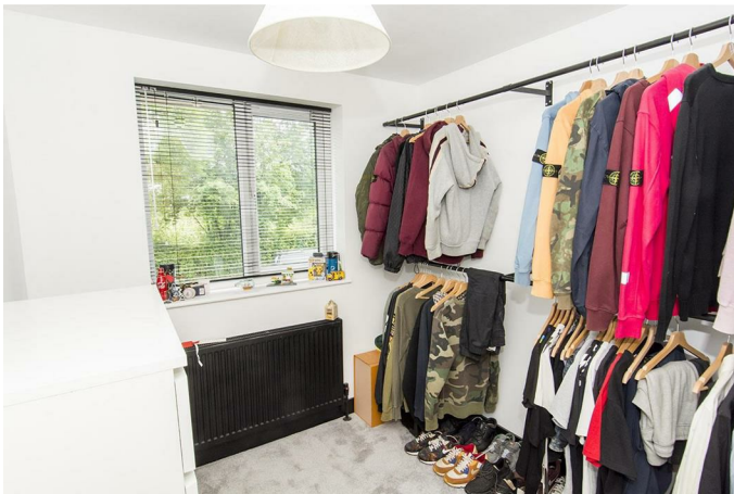
Bedroom Three 7'6" x 8'10" (2.29m x 2.69m)