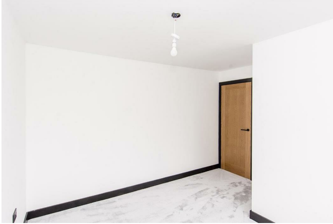
Bedroom Two (Photo Two)