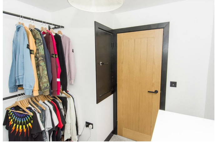
Bedroom Three (Photo Two)