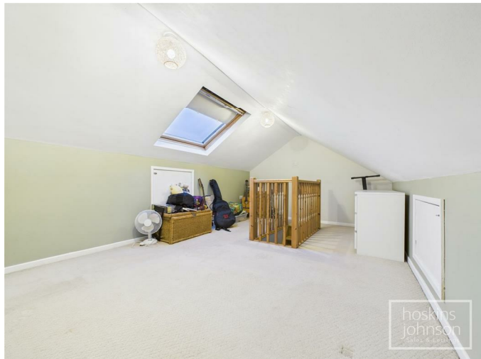
Skylight and eaves storage.