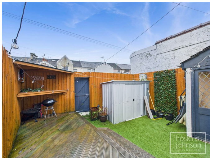
Small forecourt. Rear garden with decked seating area, artificial grass and lane access.