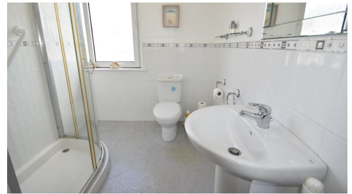
31 Murdostoun Crescent