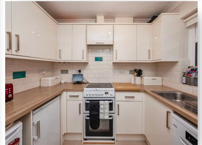
The Bungalow, Meadow View, Trunch Road, Swafield North Walsham NR28 0PE