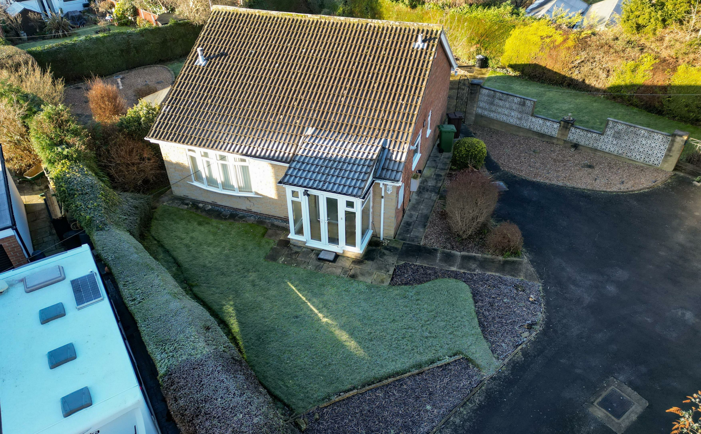
9 Parkside Gardens, Meanwood £399,995