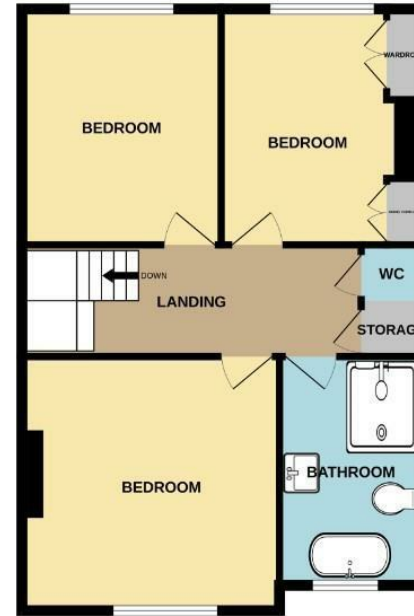
3 BED MID TERRACE

Whilst every attempt has been made to ensure the accuracy of the floorplan contained here, measurements of doors, windows, rooms and any other items are approximate and no responsibility is taken for any error, omission or mis-statement. This plan is for illustrative purposes only and should be used as such by any prospective purchaser. The services, systems and appliances shown have not been tested and no guarantee as to their operability or efficiency can be given. Made with Metropix ©2020