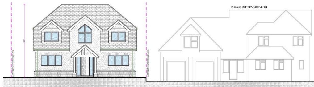
Front Elevation (Proposed)