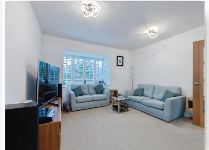
Seton Way, Fordingbridge SP6 1QN