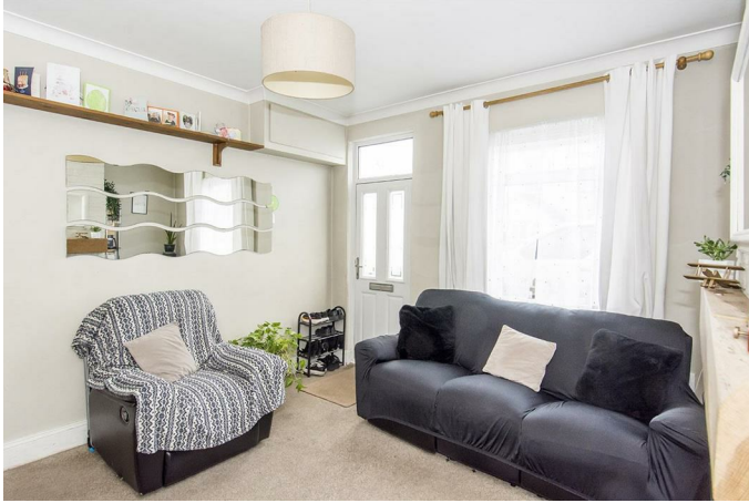
Lounge 12'0" x 11'9" (3.66m x 3.58m)

Composite double-glazed front entrance door. UPVC double-glazed window to front. Log burner. Radiator.