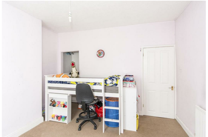
(Bedroom One Photo Two)

Double-glazed window to side. Doors to bedrooms.