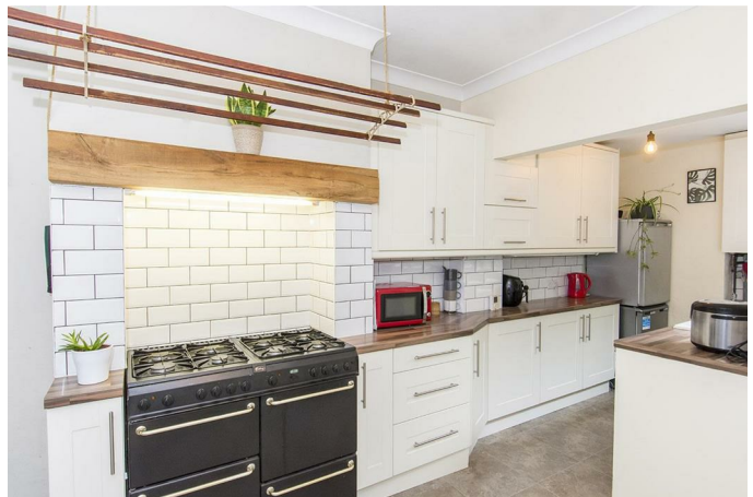
(Open Plan Kitchen/Diner Photo Two)

Opaque UPVC double-glazed rear entrance door and double-glazed window to side aspect of kitchen area. Fitted with a range of wall and floor mounted kitchen units with worktops over. Ceramic sink inset. Stove style cooker. Space and plumbing for dishwasher and washing machine. Space for fridge/freezer. Cupboard housing Vaillant gas central heating boiler. Understairs storage cupboard. Radiator.