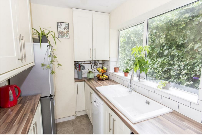
(Open Plan Kitchen/Diner Photo Three)