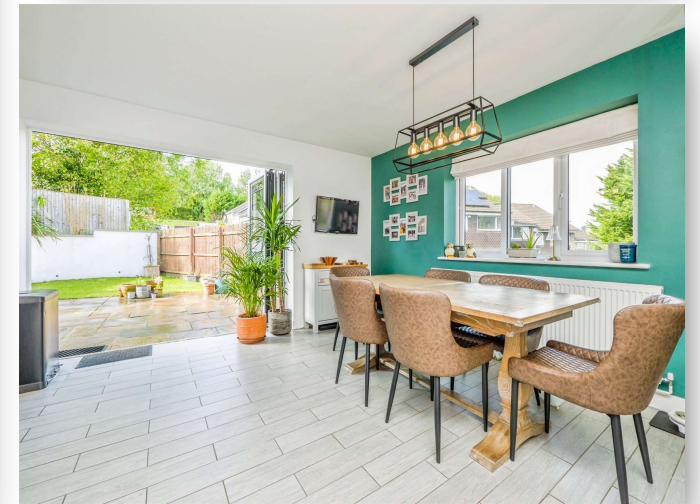
Willows House The Hawthorns, Cardiff CF23 7AP