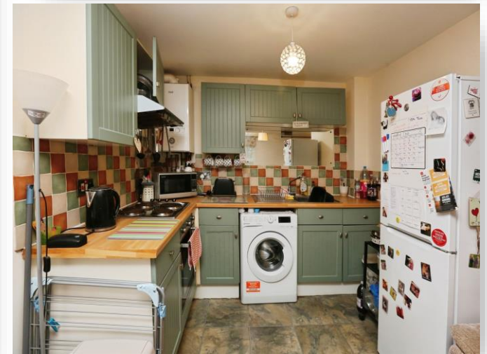
Bury Road, GOSPORT PO12 3UE