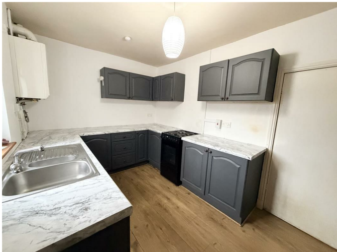
Kitchen 14'9" x 8'2" (4.51 x 2.50)

Matching range of wall and base cupboards, work surfaces over with inset one and a half bowl sink unit, wall mounted Alpha gas boiler, Upvc double glazed window to rear, staircase off, laminate floor.