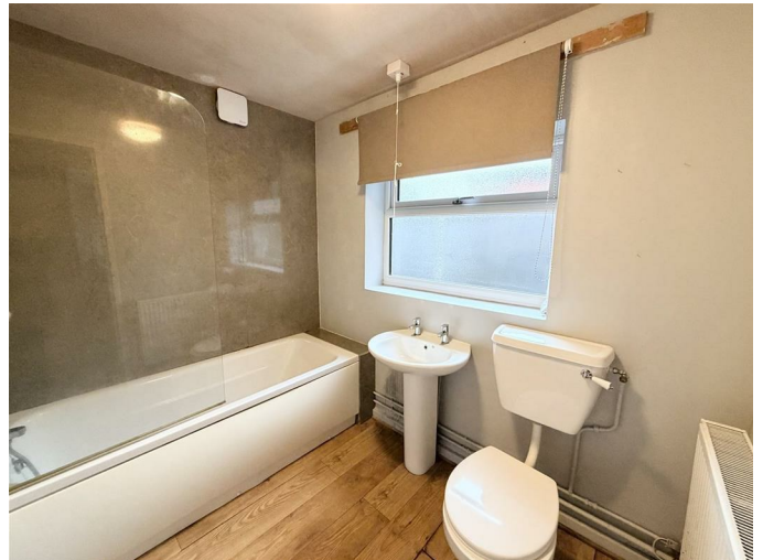
Bathroom 8'0" x 6'1" (2.46 x 1.86)

White suite comprising panelled bath with Triton shower fitment, pedestal wash basin, low level wc, radiator, Upvc double glazed frosted window to side, laminate floor.