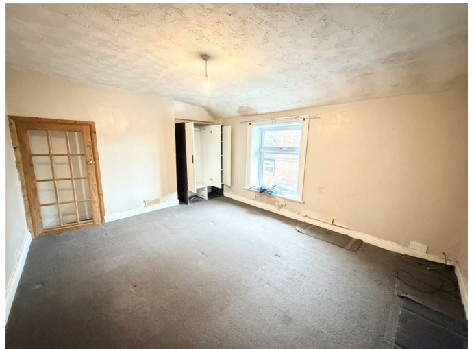
Bedroom One 14'9" x 11'5" max (4.51 x 3.50 max)

Upvc double glazed window to front, radiator, built in cupboard with glazed door.