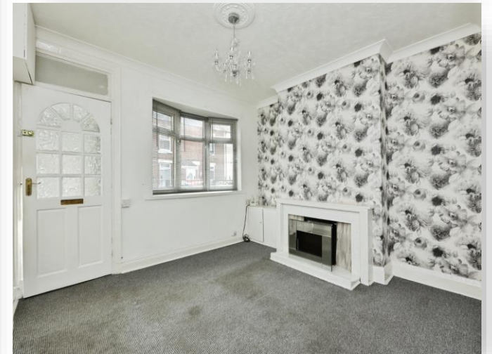
Ivanhoe Road, Conisbrough Doncaster DN12 3JT