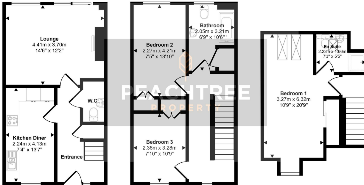
Ground Floor Approx 36 sq m / 386 sq ft

Approx Gross Internal Area 99 sq m / 1071 sq ft