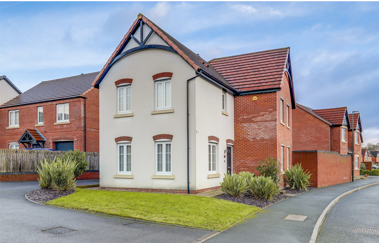
Damstead Park Avenue, Alferton, Derbyshire DE55 7PR