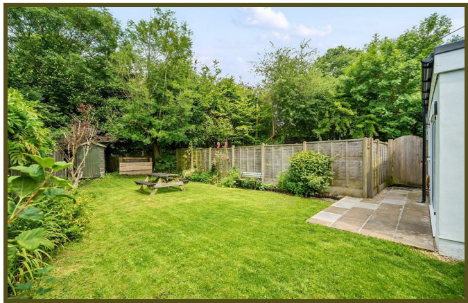
High Street, Dorchester