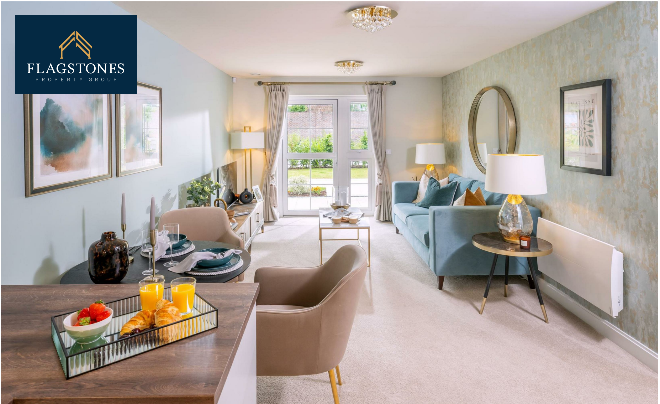
Flat 55, Jacob Place Edwin Gardens, Essex, Saffron Walden, CB10 2TB £245,000