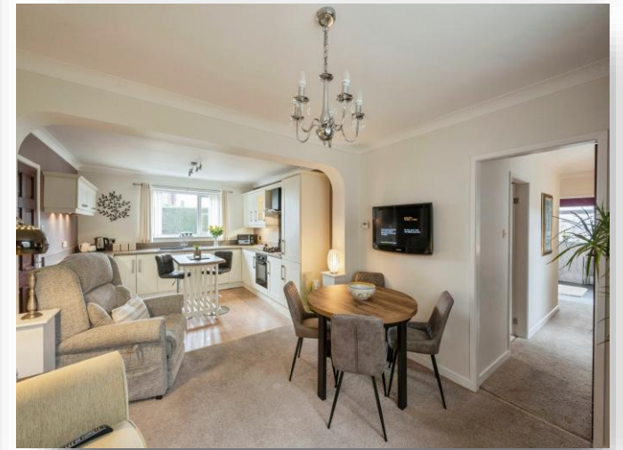
Grange Road, Wath-Upon-Deerne Rotherham S63 6LF