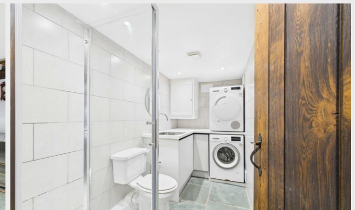
The Syke - Utility Room/Shower Room