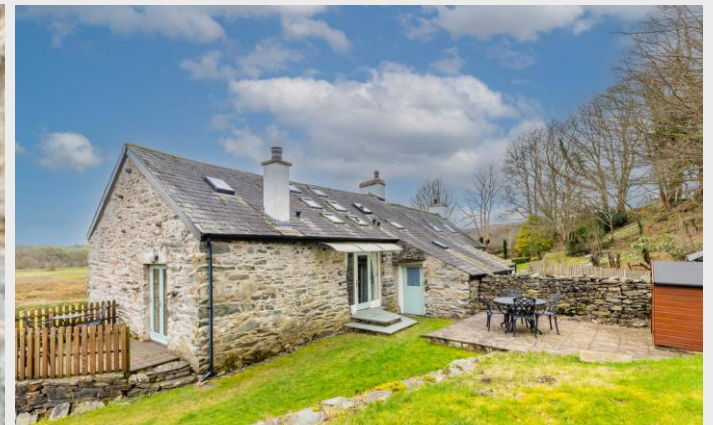
Syke Barn - Rear Garden