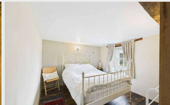
The Syke - Bedroom 2

Is every bit as impressive, offering outstanding versatility for guests, family, or as an income opportunity. The front door opens in to a fabulous, airy Hallway with exposed floorboards and full-height ceiling. The Sitting Room has a cosy multi-fuel stove and French doors opening onto a sunny deck with views down the Rusland Vally. The well-planned Kitchen/Diner includes bespoke timber cabinets, integrated NEFF hob, oven and warming drawer. A clever half size washing machine, slimline dishwasher