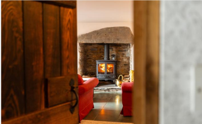
The Syke - Dining Room to Lounge