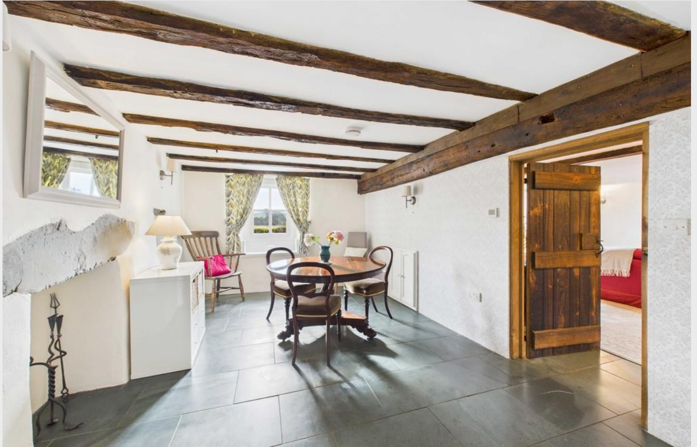
The Syke - Dining Room

Upstairs, the Landing with exposed boards leads to three comfortable Bedrooms - two generous doubles to the front, each with a window seat and superb Rusland