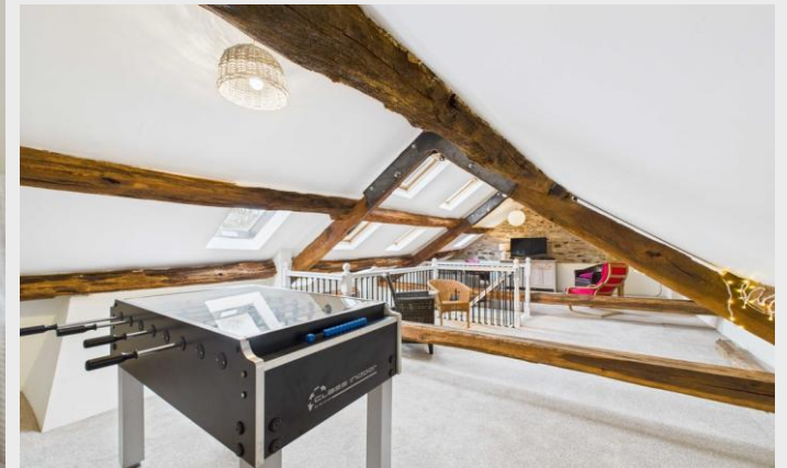
Syke Barn - Mezzanine

Anti-Money Laundering Regulations (AML): Please note that when an offer is accepted on a property, we must follow government legislation and carry out identification checks on all buyers under the Anti-Money Laundering Regulations (AML). We use a specialist third-party company to carry out these checks at a charge of £42.67 (inc. VAT) per individual or £36.19 (incl. vat) per individual, if more than one person is involved in the purchase (provided all individuals pay in one transaction). The charge is non-refundable, and you will be unable to proceed with the purchase of the