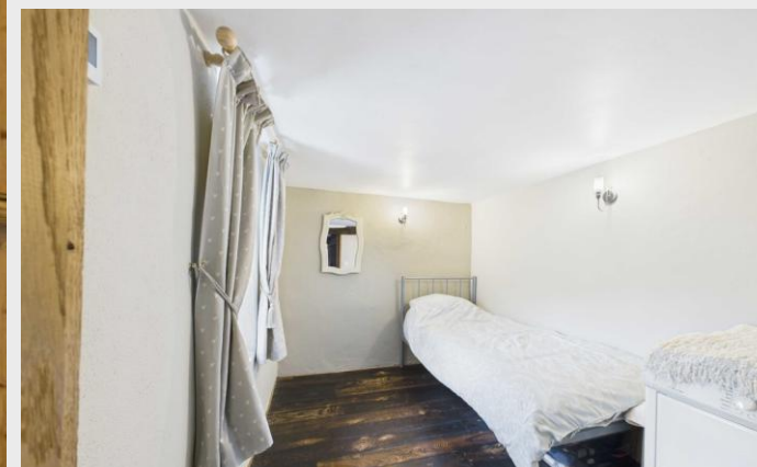
The Syke - Bedroom 3

and space saving drawer fridge. Fitted dining seating by the window enables dining with a view!