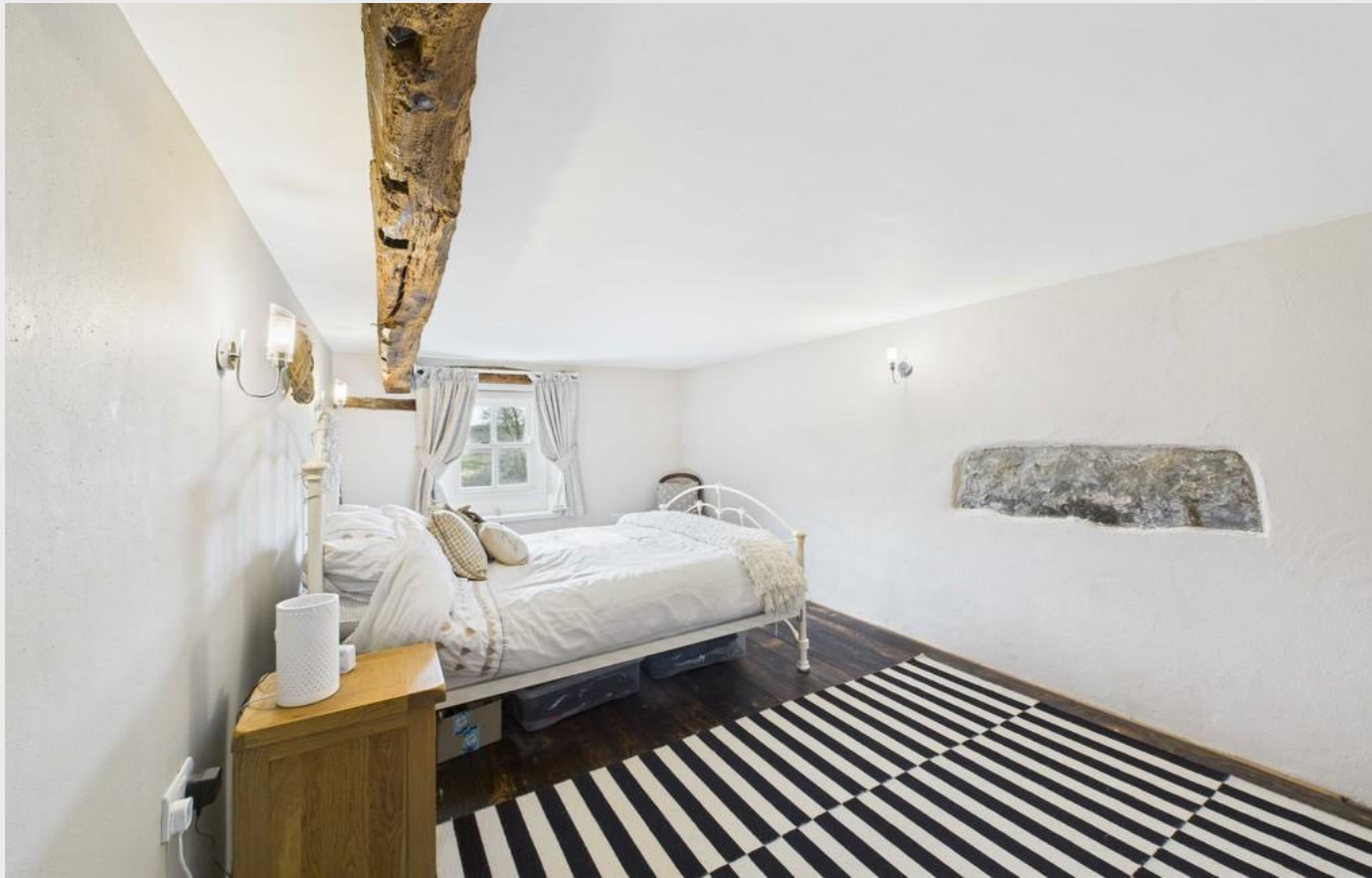
The Syke - Bedroom 1