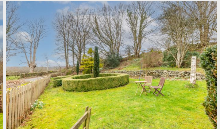
The Syke - Garden