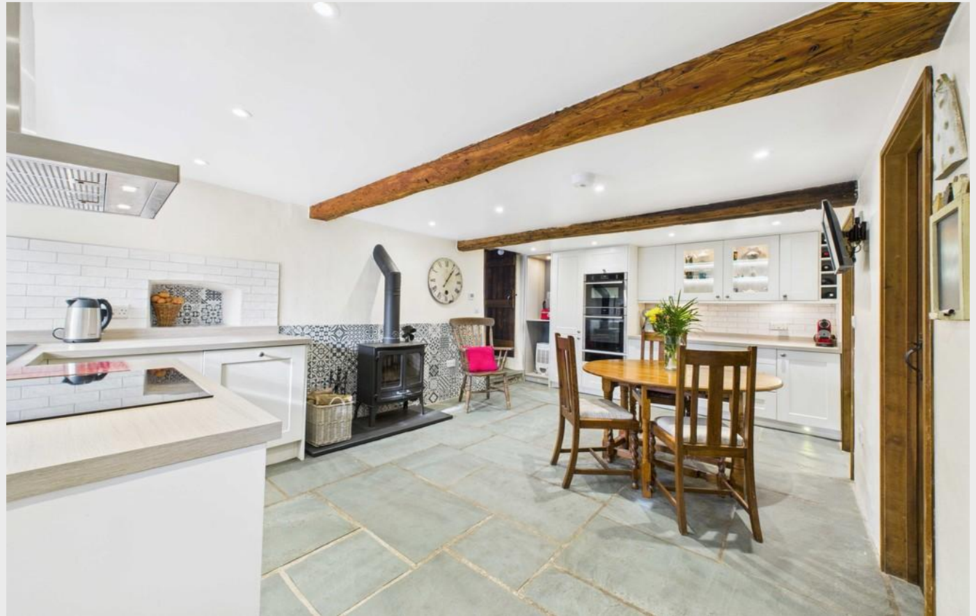
The Syke - Breakfast Kitchen

A charming, low, soft-green stable door opens into the welcoming Breakfast Kitchen - truly the heart of the home. With original stone flagged floor, exposed beams, and cosy multi-fuel stove set the tone beautifully. The kitchen itself was replaced in 2021 with stylish cream shaker units, black sink, and complementary tiling, complete with integrated dishwasher and NEFF appliances. Off this central space are three practical and enviable rooms: a Boot Room, a shelved Pantry with fridge and freezer space, and a Shower/Utility Room with plumbing for laundry appliances, WC, shower enclosure, and attractive tiling.