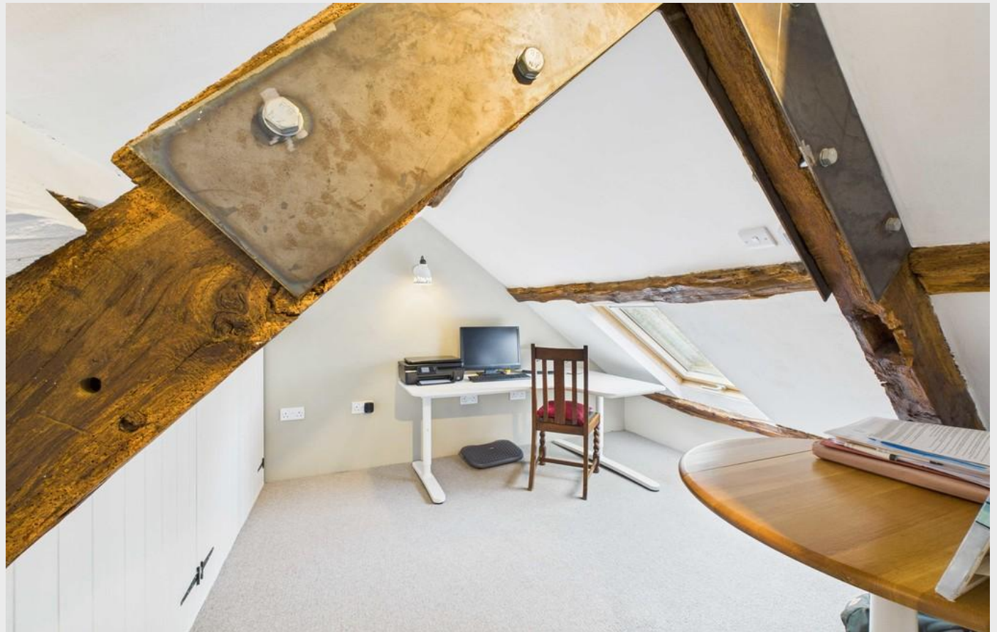
The Syke - Bedroom 4/Study