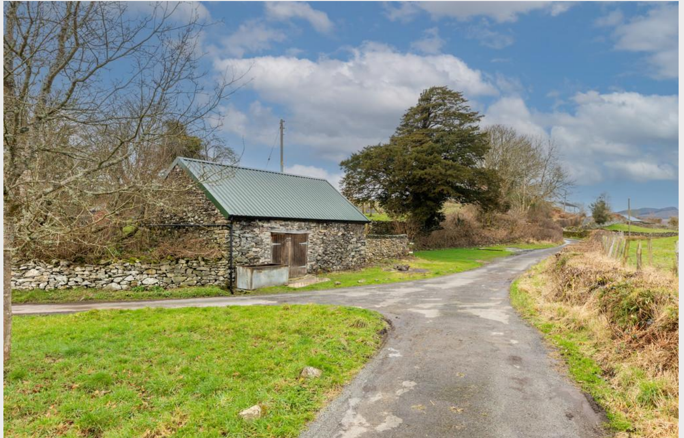
Former Original Stables

Services: Mains electricity. Private water supply.