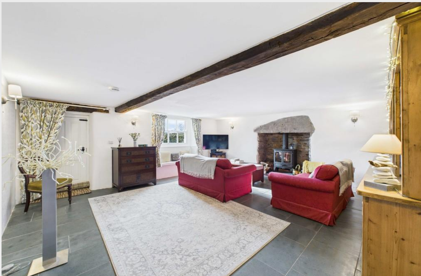
The Syke - Lounge

The delightful Cottage Garden is sunny, secure, and thoughtfully landscaped with stone terraces and attractive, neatly tended box hedging. At the top, a bench provides magical valley views - a haven for nature lovers, where deer, ospreys, red kites, and buzzards are regular visitors.