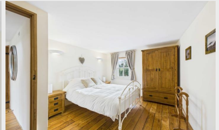
Syke Barn - Bedroom 1