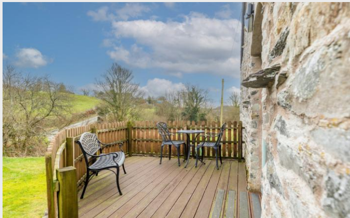
Syke Barn - Decking