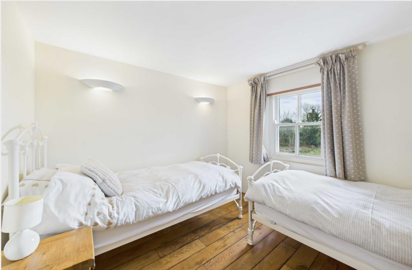
Syke Barn - Bedroom 2