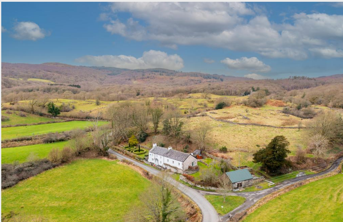
Property and surroundings