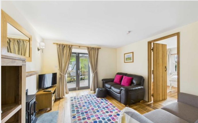
Syke Barn - Sitting Room