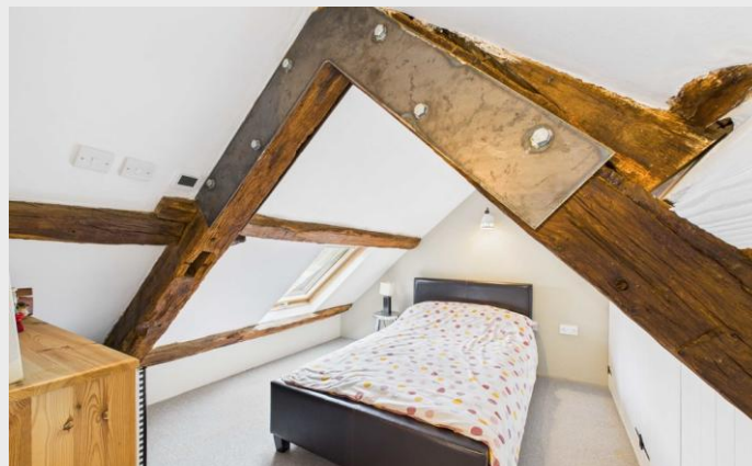
The Syke - Bedroom 4

Upstairs, the superb Mezzanine level shows off the magnificent exposed ancient beams and eight Velux windows, creating a bright and airy multi-use space - ideal as a Studio, Library, Games Room, or as currently, extra lounging space.