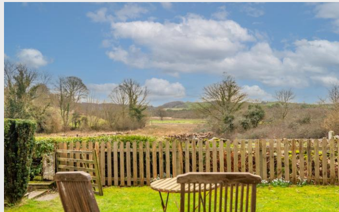
The Syke - Garden