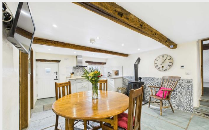
The Syke - Breakfast Kitchen