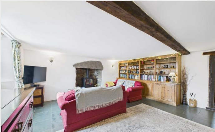
The Syke - Lounge

Step up into the Dining Room, perfect for gatherings, with a deep window seat and charming stone reveals.