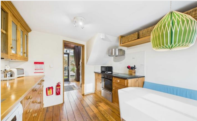
Syke Barn - Dining Kitchen