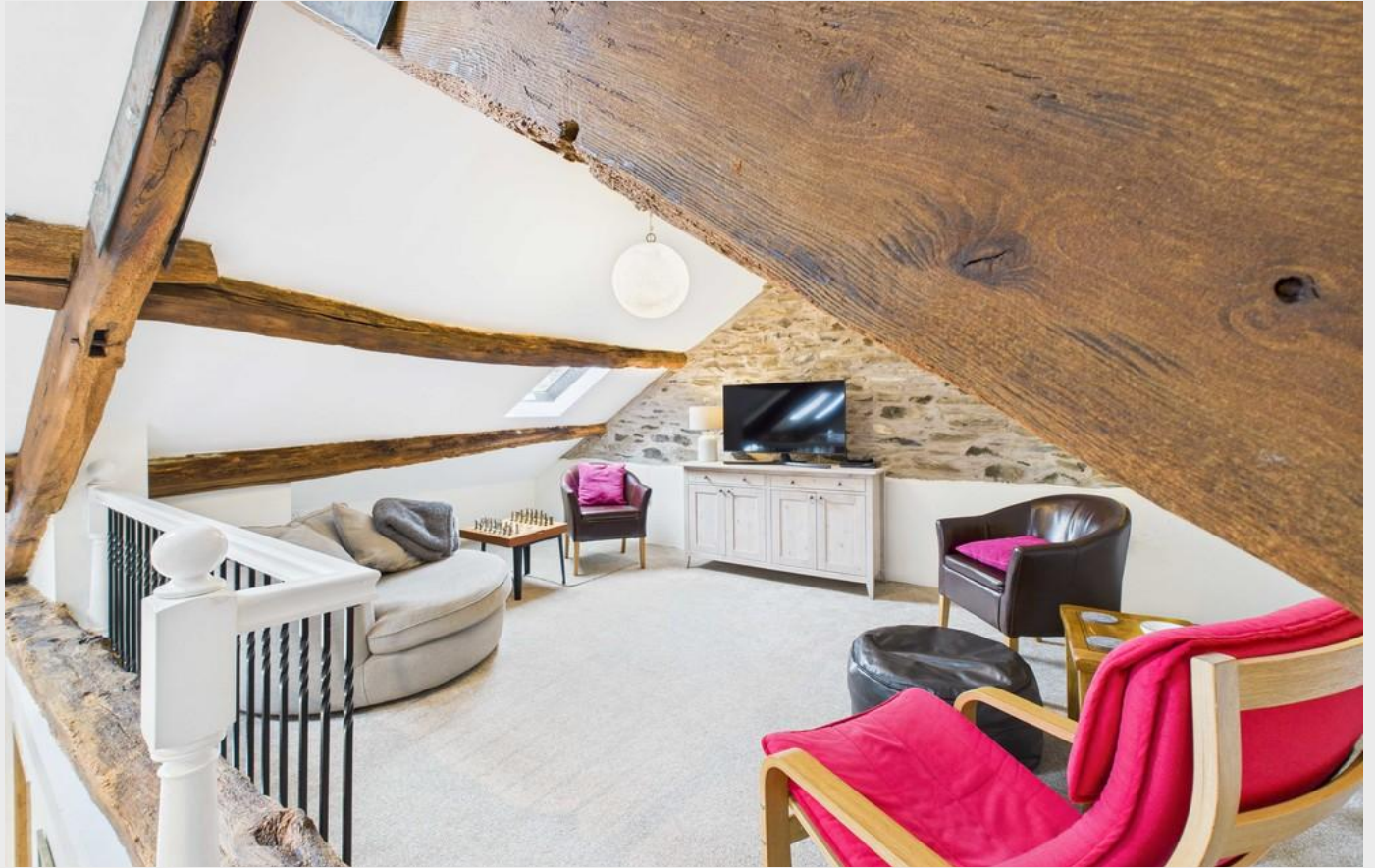
Syke Barn - Mezzanine