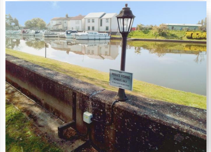
Birch Grove, Torksey LINCOLN LN1 2EZ