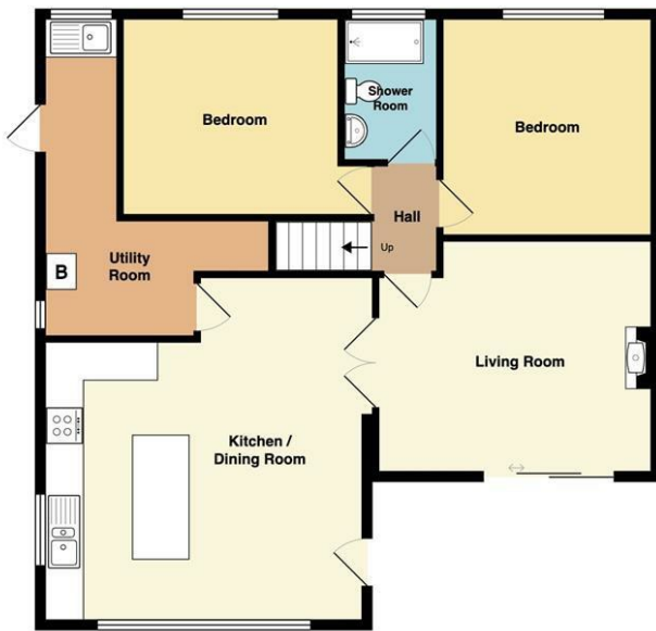
Ground Floor Area (approx): 83.6 m 2 ... 900 ft 2