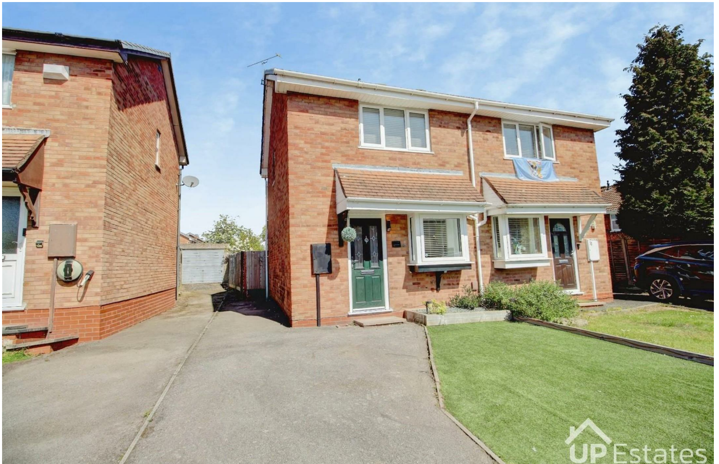
Lymore Croft, Coventry