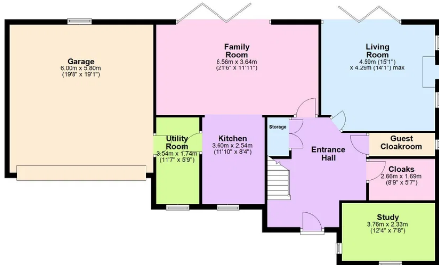
Ground Floor Approx. 128.7 sq. metres (1385.8 sq. feet)