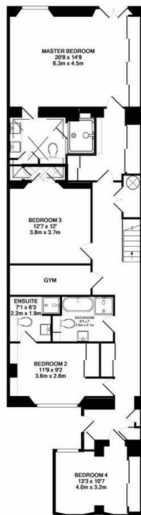
LOWER GROUND FLOOR APPROX. FLOOR AREA 1389 SQ.FT.