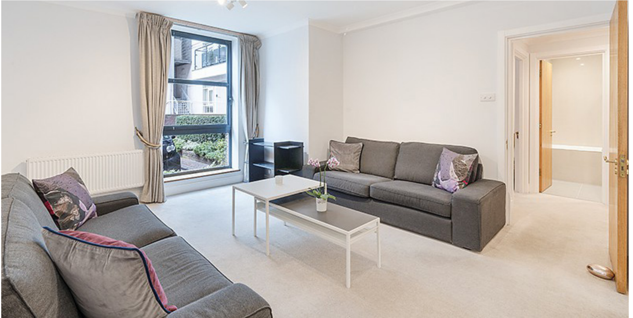
WATERSIDE POINT, Battersea SW11