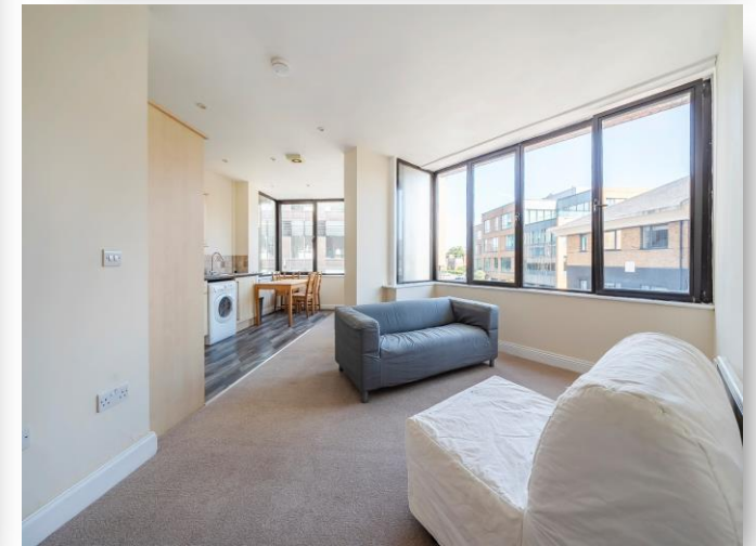
Flat 8 Butler House, 19-23 Market Street, Maidenhead SL6 8AA