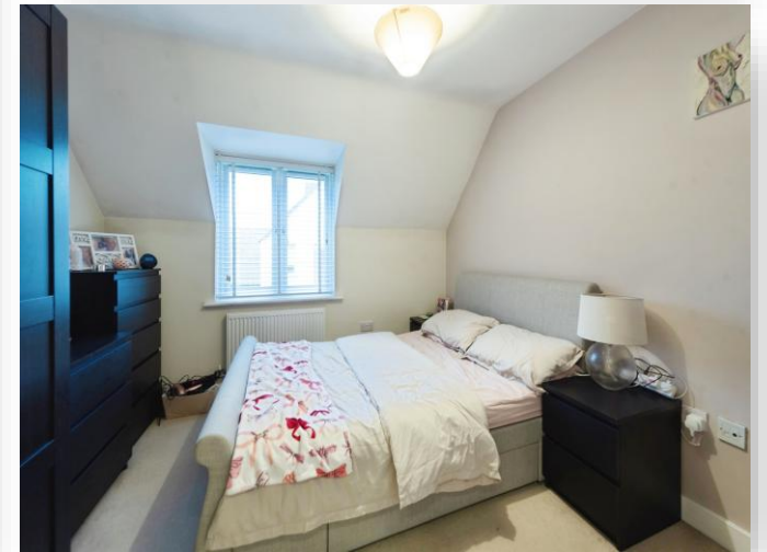
Abbess Way, Waterlooville PO7 7HJ