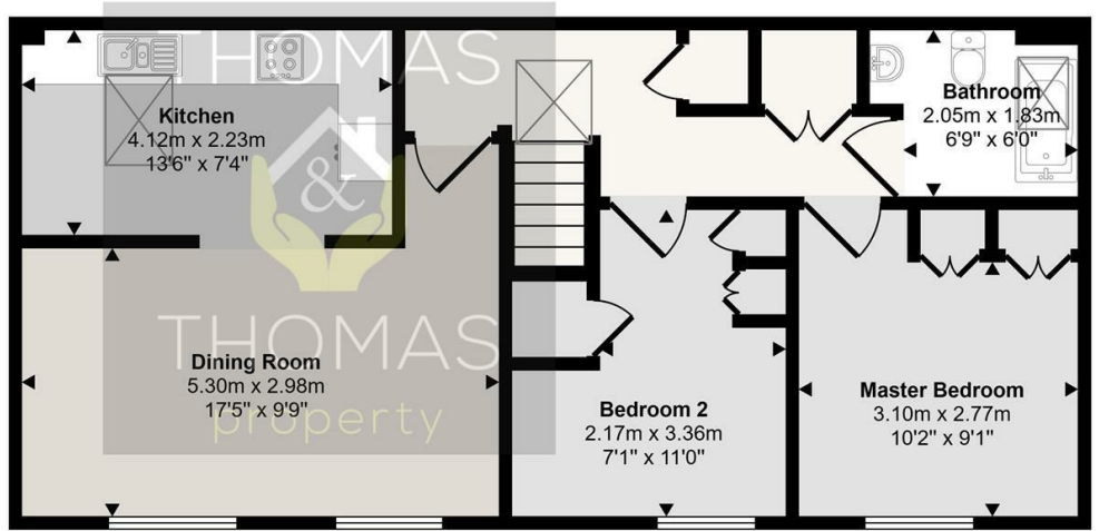
First Floor Approx 63 sq m / 682 sq ft

This floorplan is only for illustrative purposes and is not to scale. Measurements of rooms, doors, windows, and any items are approximate and no responsibility is taken for any error, omission or mis-statement. Icons of items such as bathroom suites are representations only and may not look like the real items. Made with Made Snappy 360.