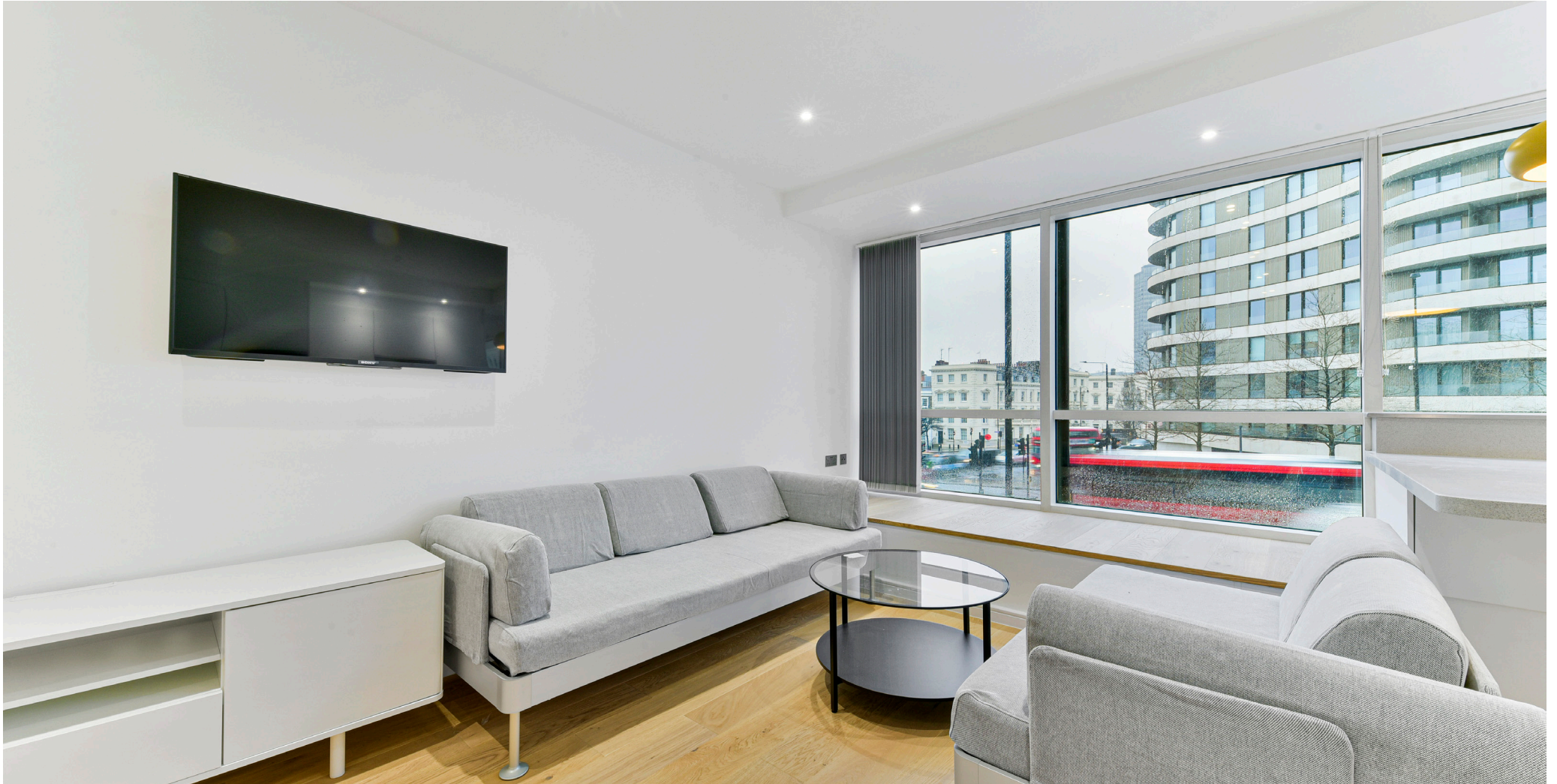
THE PANORAMIC, Westminster SW1V