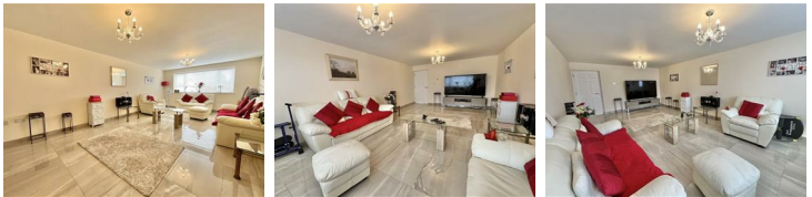
Reception Lounge 23'7" x 12'11" (7.21 x 3.95)