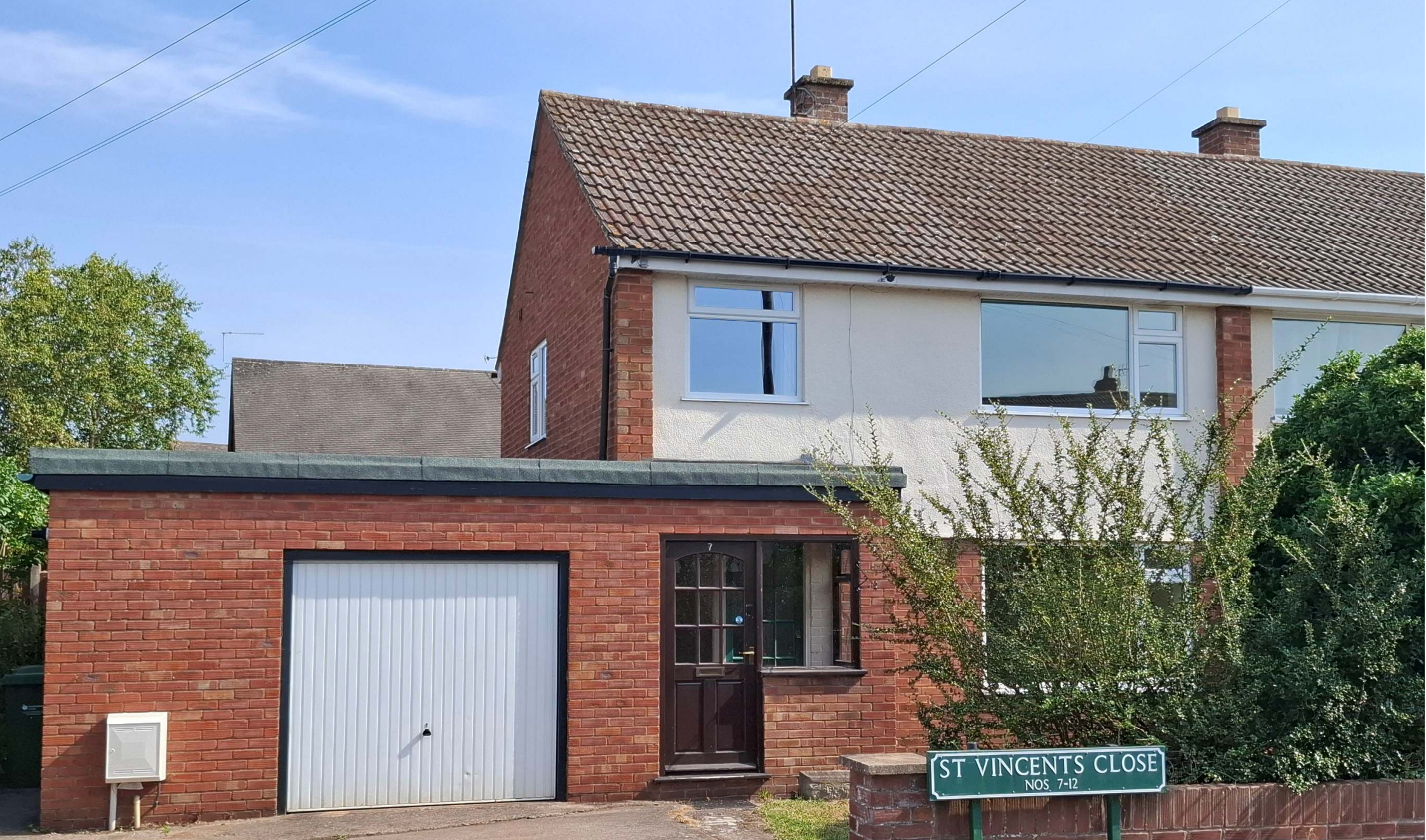
7 ST VINCENTS CLOSE Hereford, HR2 6EL