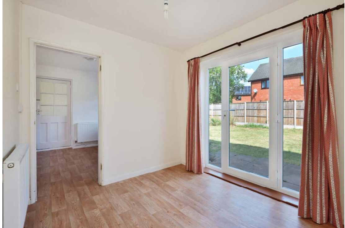
Breakfast room/lounge through to kitchen and utility room