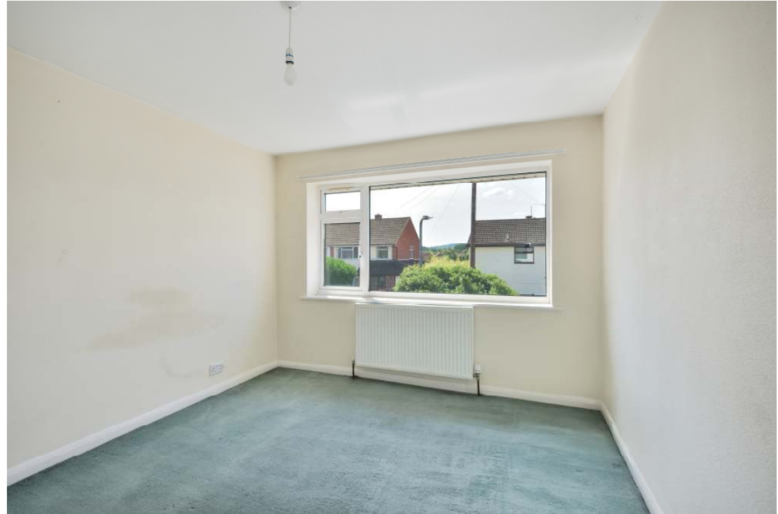
Three bedrooms with supporting bathroom