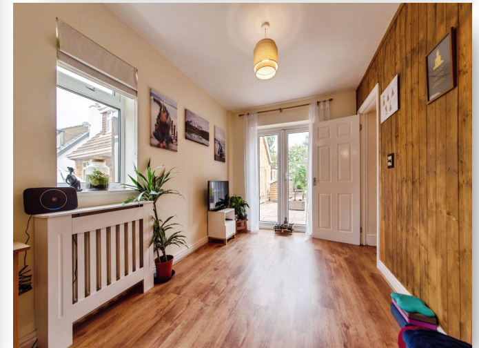
Pinfold Lane, Ruskington Sleaford NG34 9EU