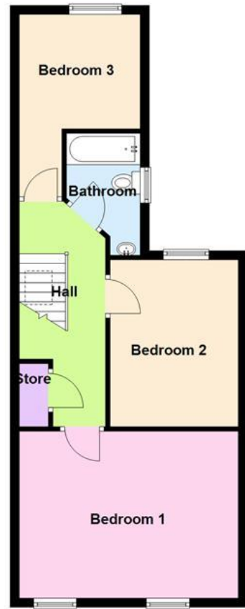
First Floor Approx. 50.6 sq. metres (544.8 sq. feet)

Total area: approx. 107.6 sq. metres (1158.3 sq. feet)