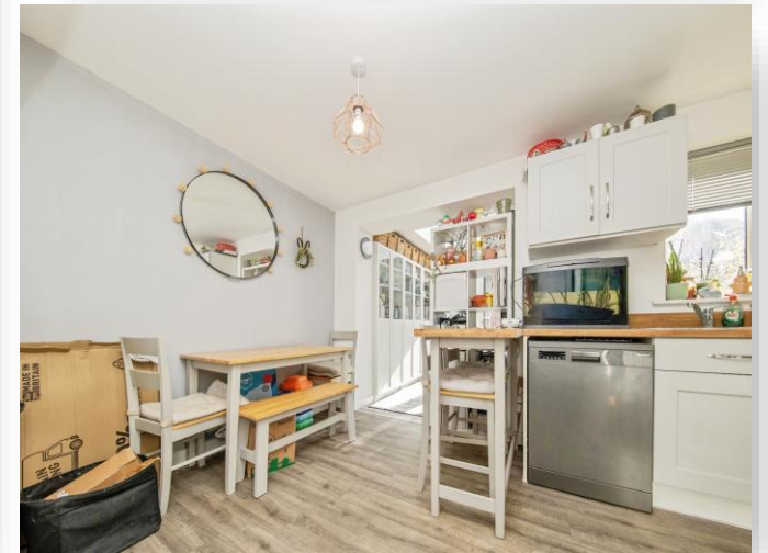
Hornbeam Close, Great Blakenham, Ipswich, IP6 0NR