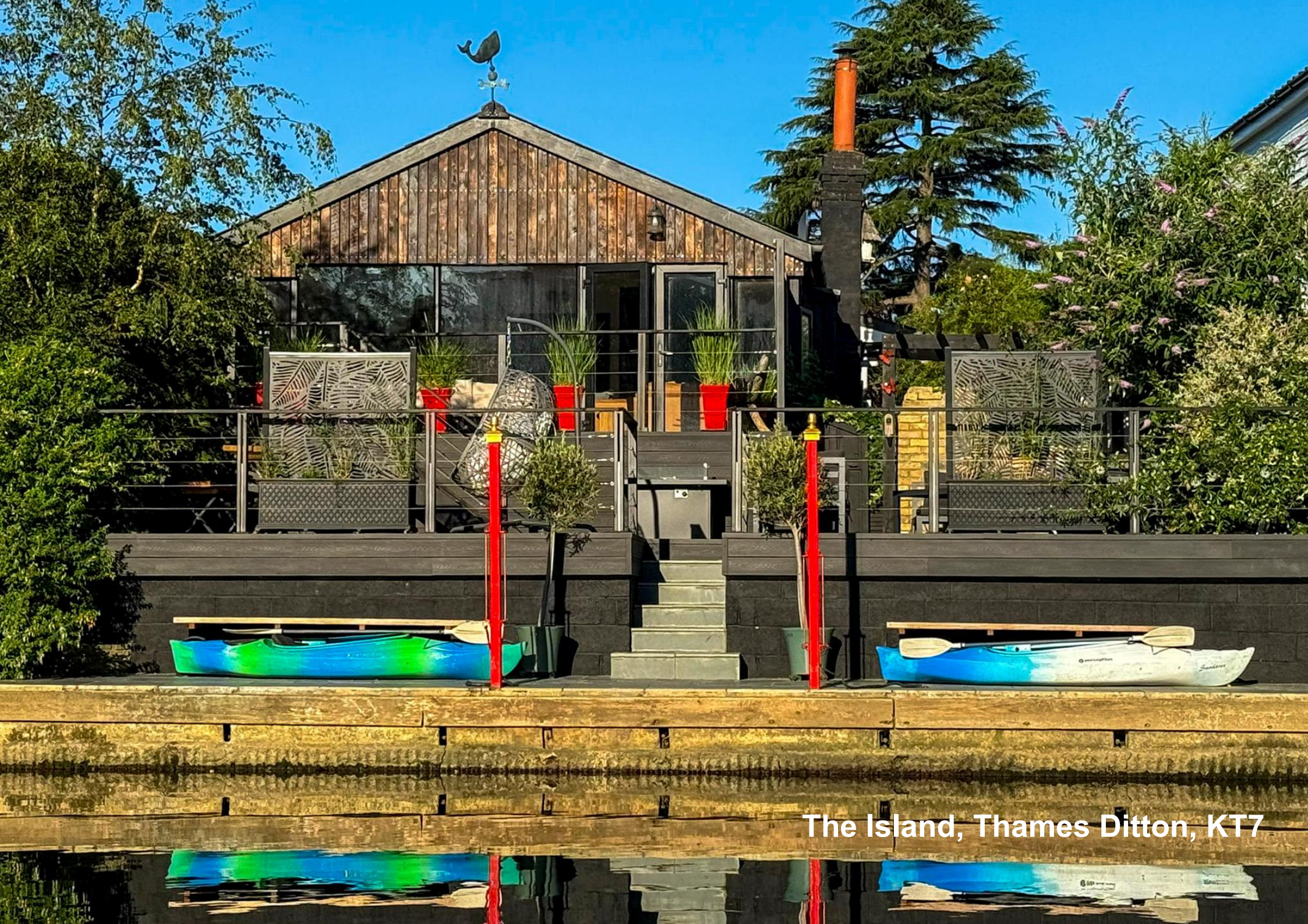
The Island, Thames Ditton, KT7