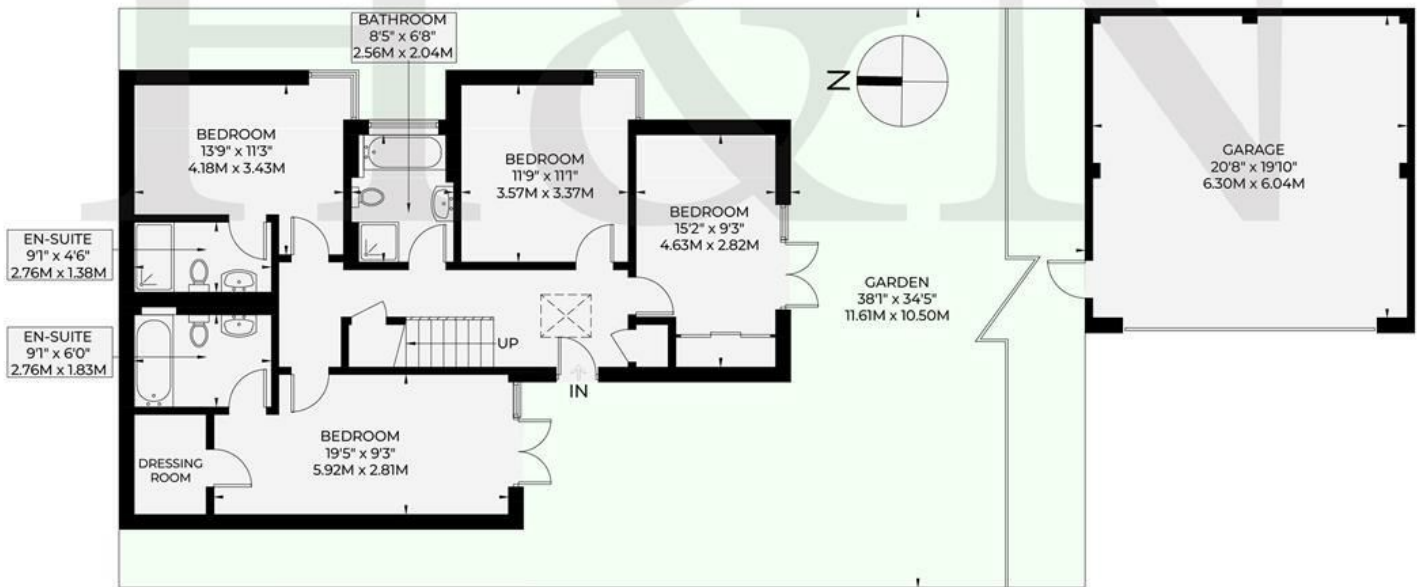
Ground Floor 90.4 sq m / 973 sq ft