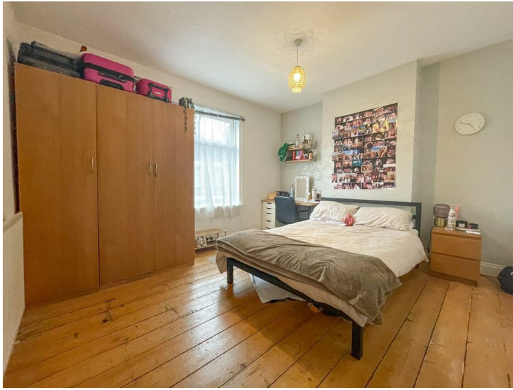
BEDROOM TWO 11'3" x 9'9" (3.45 x 2.98) Built in cupboard, radiator, double glazed window to rear aspect.