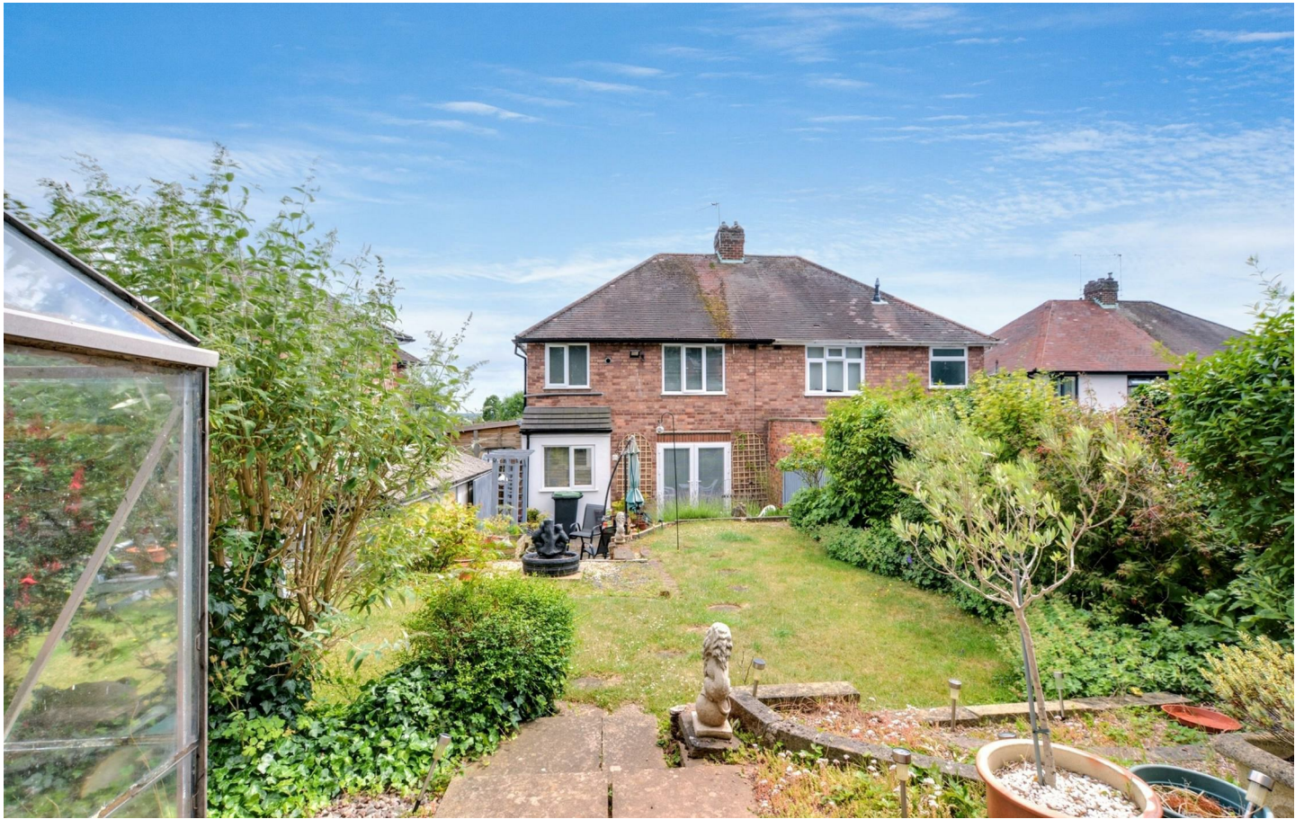
A WELL PRESENTED BAY FRONTED HOME IN A SOUGHT AFTER LOCATION.

Robert Ellis are delighted to offer to the market this well presented traditional semi detached home offers a perfect blend of character and modern comfort. Situated in a highly desirable area, the property boasts off road parking and a generous rear garden, making it an ideal choice for a range of buyers. The home features three bedrooms and two spacious reception rooms to the ground floor, with a bay-fronted dining room adding a classic charm and floods the space with natural light, while the second reception room offers a perfect space for the living room overlooking the rear garden. Upstairs, the property continues to impress with well-proportioned bedrooms and a clean, contemporary finish throughout. Outside, the large rear garden is a true highlight—beautifully maintained and featuring an elegant Swedish-style seating area, ideal for outdoor dining or unwinding in style. Additional benefits include a detached garage (currently not accessible for vehicle use), and the excellent location puts you just a short distance from the tram network, local amenities, and major transport links including the A52.