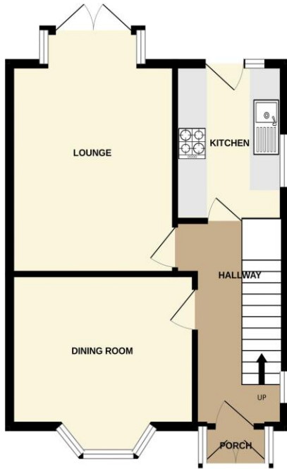
GROUND FLOOR 441 sq.ft. (41.0 sq.m.) approx.