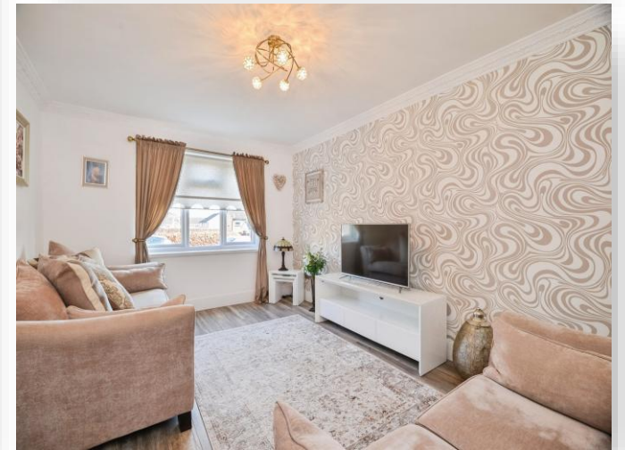
Cardinal Grove, Stockton-On-Tees TS19 7ST