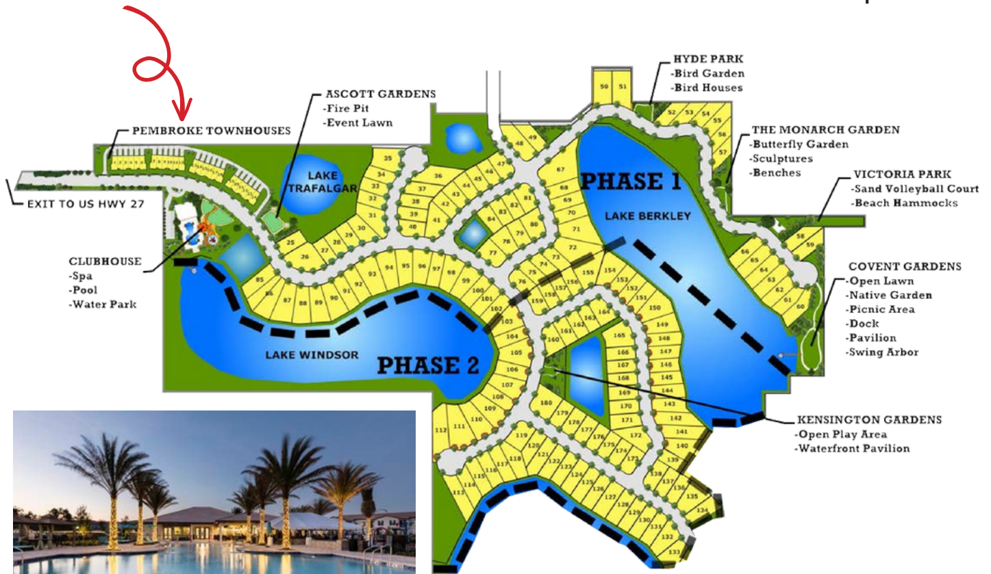
Photo: Balmoral Resort Florida Phase 1 & Phase 2 Map