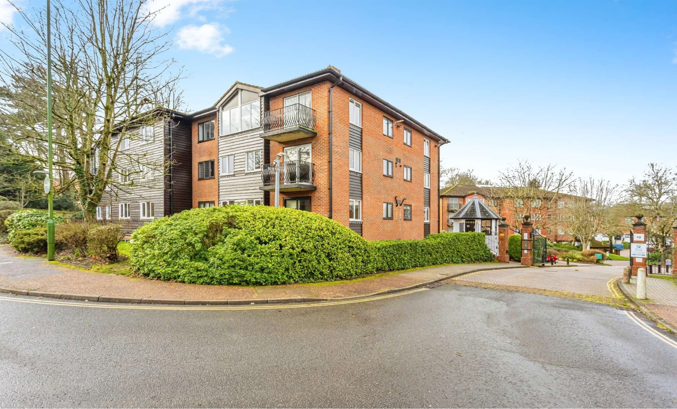
Stamford House, Great Heathmead, HAYWARDS HEATH RH16 1FH