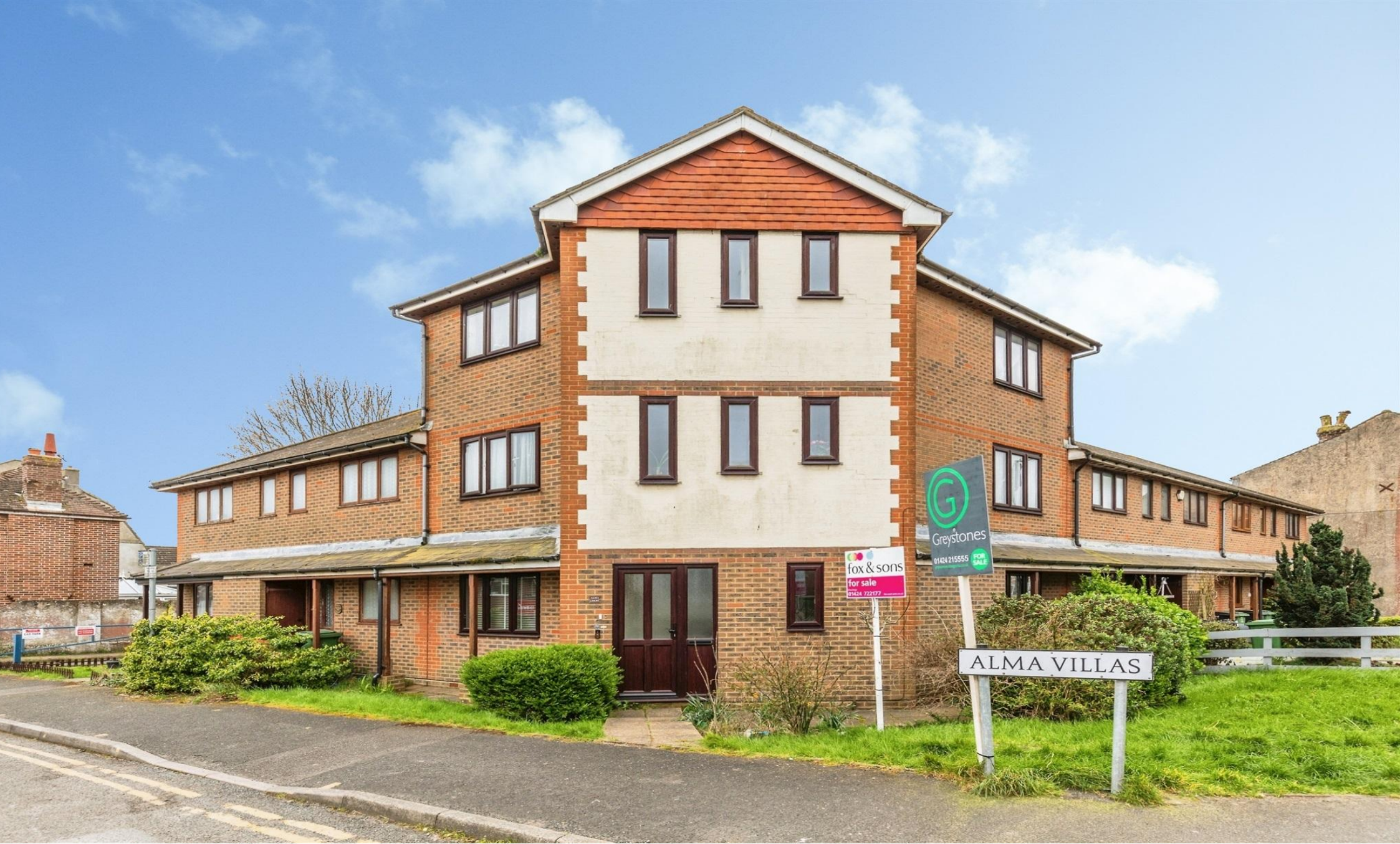
Alma Court, St. Leonards-On-Sea TN37 7EX