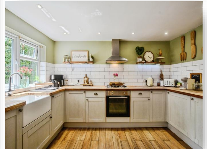
Primrose Cottage East End, Thorpe St. Peter Skegness PE24 4PQ