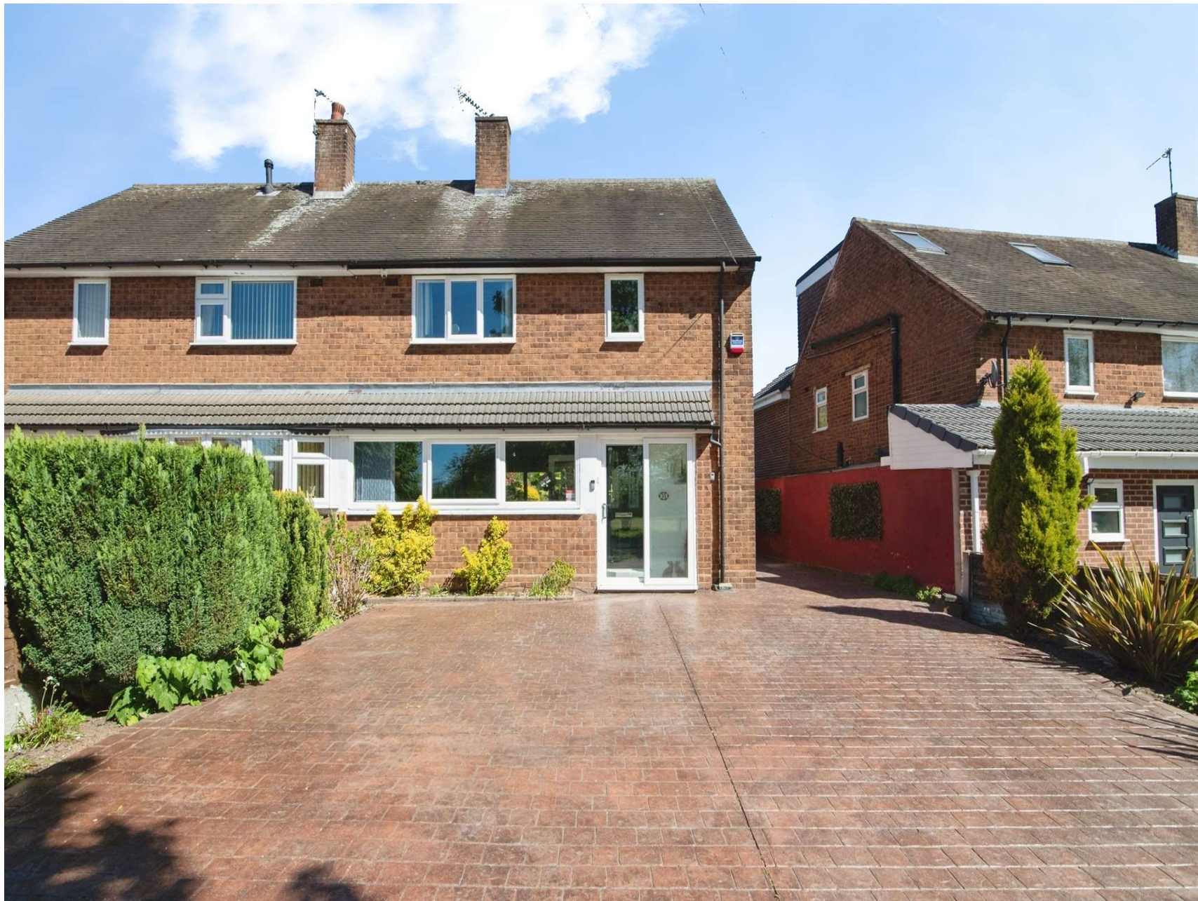
Tanhouse Avenue, Birmingham B43 5AB