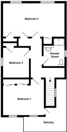
First Floor Total Area: 63.0 m² ... 678 ft² All measurements are approximate and for display purposes only

Anti Money Laundering checks at £36 Per Purchaser will be required before a sale can be Livened. Please see the property on the Clarks Website for further details.