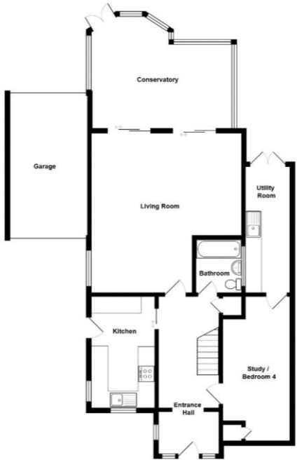
Ground Floor Total Area: 114.9 m² ... 1237 ft² All measurements are approximate and for display purposes only Floorplans created by Clarks Estates 01243 861344