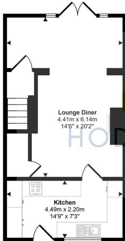
Ground Floor Approx 38 sq m / 407 sq ft

Approx Gross Internal Area 66 sq m / 708 sq ft